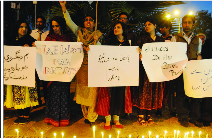
Members of Insani Haqooq Ittehad chanting slogans against NATO aggression in Islamabad.