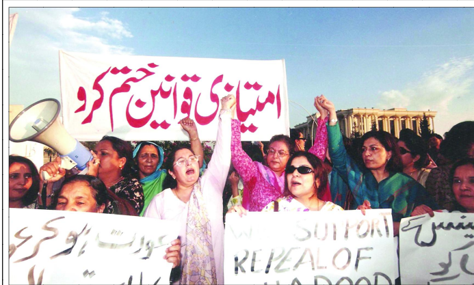
Movement for repeal of the Hudood Ordinances

In 2010, came two laws to curb sexual harassment against women as official bills. The first one is Criminal Law (Amendment) Act, 2010, which makes amendment in section 509 of the PPC relating to sexual harassment of women at workplace. This is a good piece of legislation. The Act defines the offence of sexual harassment and says that the offence "shall be punished with imprisonment which may extend to three years or with fine up to five hundred thousand rupees or with both". The other, more comprehensive law titled "The Protection against Harassment of Women at the Workplace, Act, 2010". This is the main and comprehensive law to address the issue of sexual harassment of women at workplace. AASHA, a civil society coalition must be credited and appreciated for its dedication and pursuance to take the bill to its final stages and get it passed. Ms. Sherry Rehman, who was holding the portfolio of Information Minister at that time made special efforts to hold two broad-based consultative meetings of various stakeholders to have input and feedback on the bill. Aurat Foundation was part of these consultation meetings and the suggestion of setting up the institution of Federal Ombudswoman under the Act came from one of its representative. This bill was passed by the National Assembly on 22 January